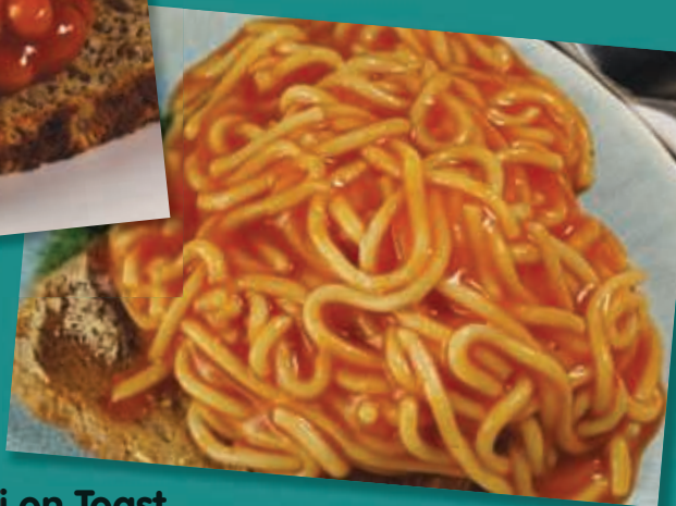
Baked Beans/Spaghetti on Toast