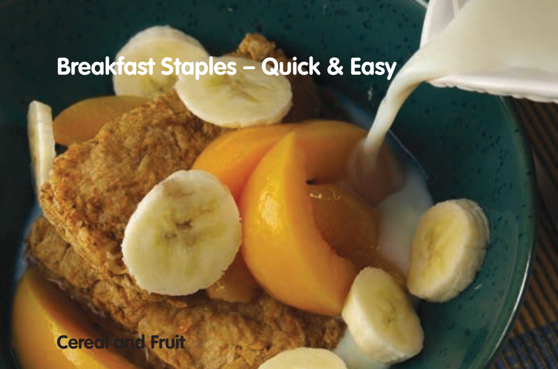
Cereal and Fruit