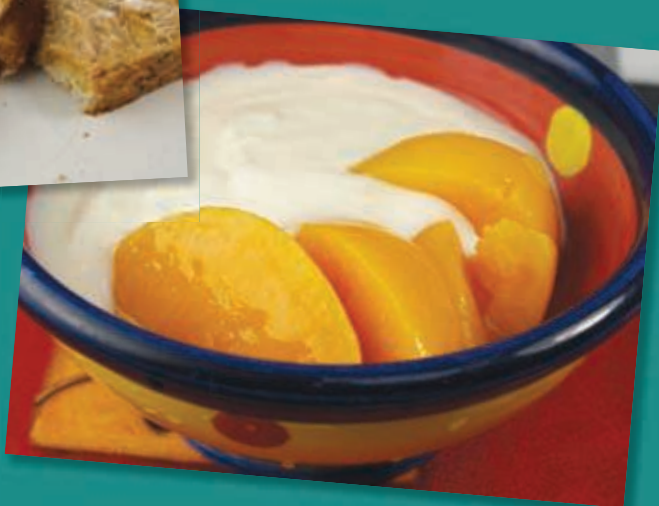
Yoghurt and Fruit