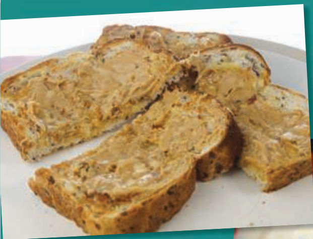
Toast and Spreads